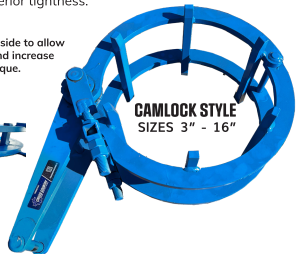
CAMLOCK STYLE SIZES 3" - 16"