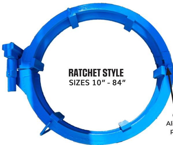
RATCHET STYLE SIZES 10" - 84"

Conveniently placed on the outside to boost weld access and torque for superior tightness.